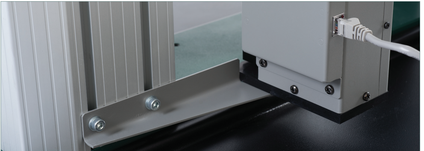
Model 100R long travel extensometer machine mounting detail.