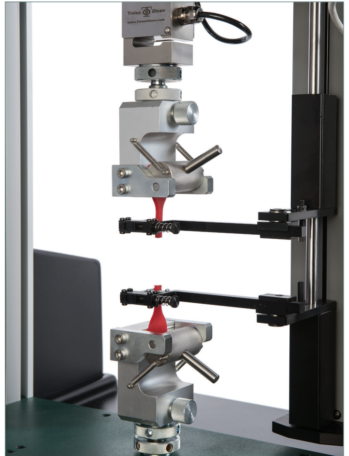
Model 100R long travel extensometer on specimen at specimen break.