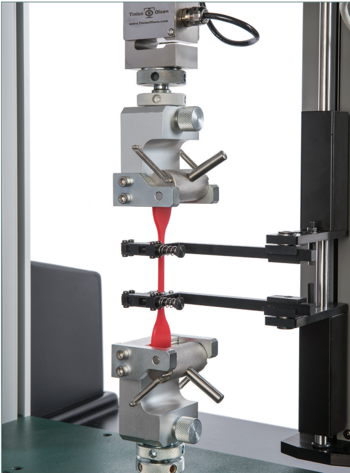
Model 100R long travel extensometer on specimen.