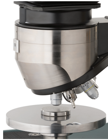
FH-11 Series with six-position motorized turret